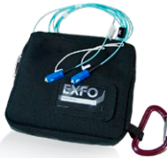
EF launch fiber (SPSB-EF-C30)

Whether for expanding enterprise-class businesses or large-volume data centers, new high-speed data networks built with multimode fibers are running under tighter tolerances than ever before. In the event of failure, intelligent and accurate test tools are needed to quickly find and fix the fault.